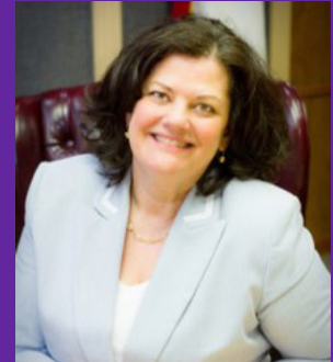
Shelley Brophy, Nacogdoches mayor