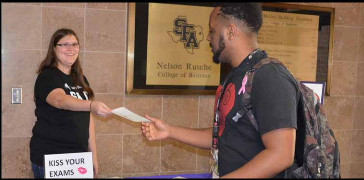
Student Advisory Council gave out free Scantrons for business students to use during finals week. In addition to this event, SAC also helped with Showcase Saturday and the C2C Conference in March.