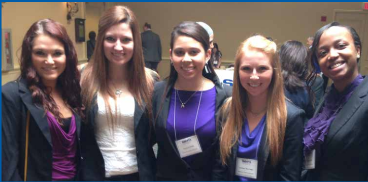
The SFA chapter of Society for Advancement of Management won first place in the Campus Chapter Performance Program in the Large Chapter Division.